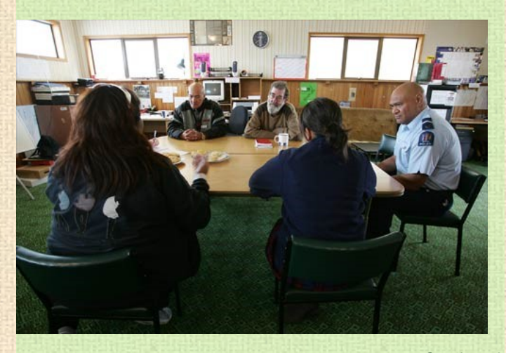
All images on this page from <www.teara.govt.nz/> Continued

The final day for submissions was 14 September. While you may technically be out of time, if you have a submission to make, we hope that you will still do so (by emailing Ycapideas@justice.govt.nz), given that it is such an important opportunity to contribute to the reinvigoration of the approach to youth offending. We would be hopeful that your submission could still be considered.