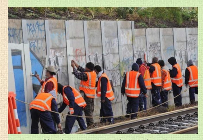
Diversionary programmes/community work

Officials have been consulting with frontline practitioners, non-government organisations, experts and other interested parties who regularly work with child and youth offenders. In addition, extensive consultation is being held with Māori through a reference group and a series of hui across the country.