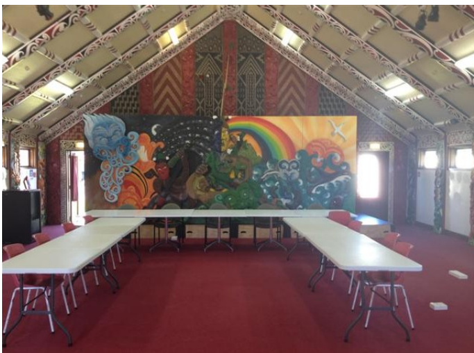
The purpose-built whare where te Kōti Rangatahi will sit

The Whare where the Rangatahi Court will sit is also stunning in its depiction of Māori creation traditions. It lends itself perfectly as a Rangatahi Court.