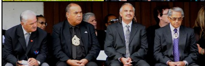
Manuhiri being welcomed on during powhiri

The powhiri was due to start at 10.00 am and by then a sizeable group of manuhiri had gathered at the gate - approximately 150 to 200 guests made up of stakeholders, whānau and other supporters.