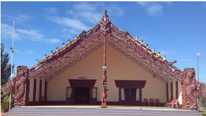
The wharenui at Ngā Hau e Whā marae

Te Kōti Rangatahi ki Ōtautahi was launched on 22 March 2014 at Ngā Hau e Whā Marae in Christchurch. This occasion celebrated the first Rangatahi Court to be established in Te Waipounamu, the South Island, at Christchurch's national marae.