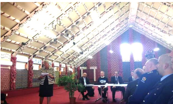
Chief Justice Dame Sian Elias giving her kōrero

The Chief Justice, in her address, raised three main points about the current youth justice climate in Aotearoa New Zealand. First, young people always have and always will get into trouble. But now more than ever, we know about the connections between offending and neurodisability, alienation from whānau, school and community, substance abuse and young people that have been victims themselves of abuse and neglect. This knowledge must be seized upon.